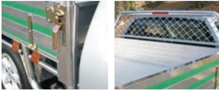
Integrated corner posts & LED brake light