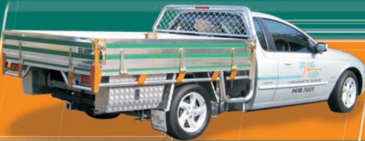
Shown with optional extras