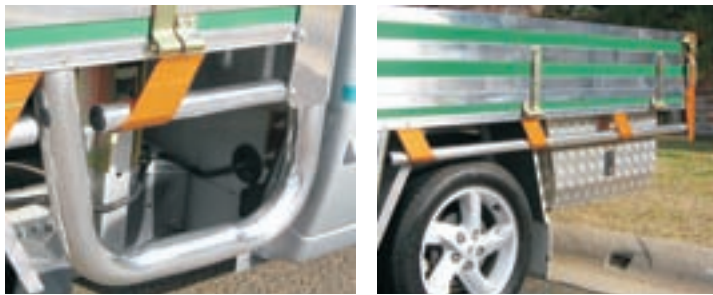
Heavy duty step with continuous rope rail insert