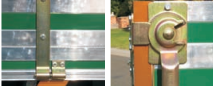
Heavy duty hinges and corner fasteners